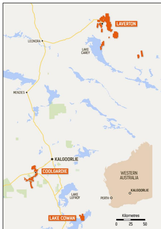
Figure 1: Focus project locations.

Focus’ cash balance remains strong at the end of the June Quarter, at $58.5M. This financial strength enables the Company to pursue its strategy of continuing exploration at both Coolgardie and Laverton while planning for a potential restart of operations at Coolgardie.