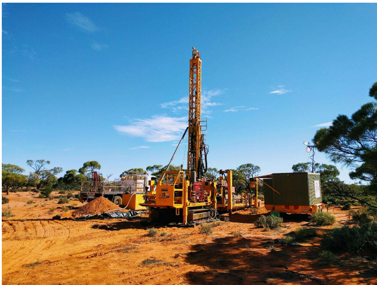
Drilling first hole at Mt Gunson.

The drilling program is primarily intended to obtain 500kg of metallurgical samples for the next stage of testwork and flowsheet design and to update the JORC Resources for both deposits to JORC 2012 requirements.