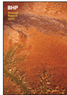
Annual Report 2017