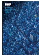
Economic Contribution Report 2017

If you would like further information or would like to change your previous election in relation to electronic or hard copy communications, please contact: