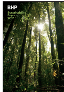
Sustainability Report 2017