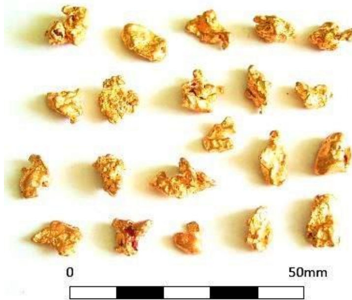
Figure 1. Gold nuggets from the Beowulf Gold Project, approximate scale.

The applications consist of five exploration leases (E31/1165, E28/2706, E28/2707, E28/2713 and E28/2714). Upon geological evaluation of the area it was established that the leases adjacent had existing eluvial mining, which has been producing gold for the past decade (samples shown in Figure 1). A binding agreement has been reached to purchase the leases from the local prospectors.