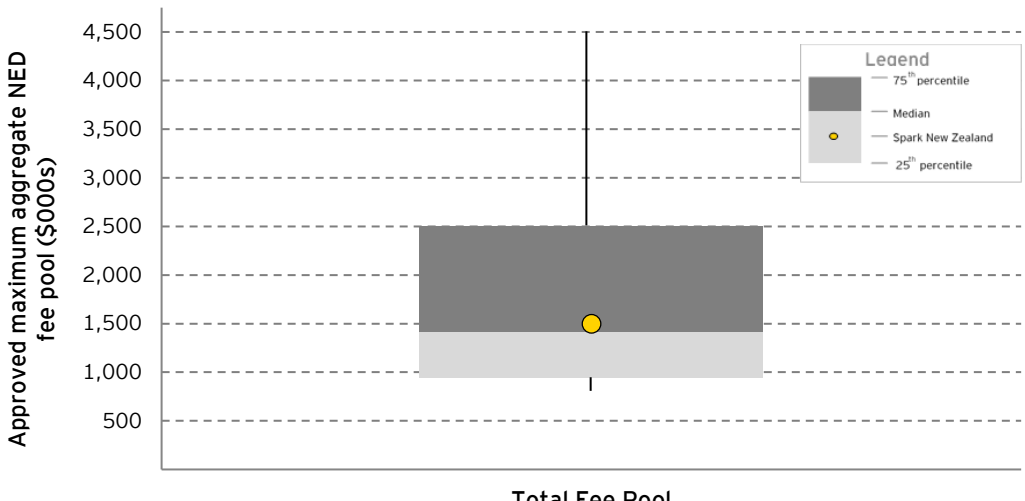
Total Fee Pool

The diagram below shows the positioning of Spark's approved aggregate NED fee pool to the approved maximum aggregate NED fee pool of the comparator group.