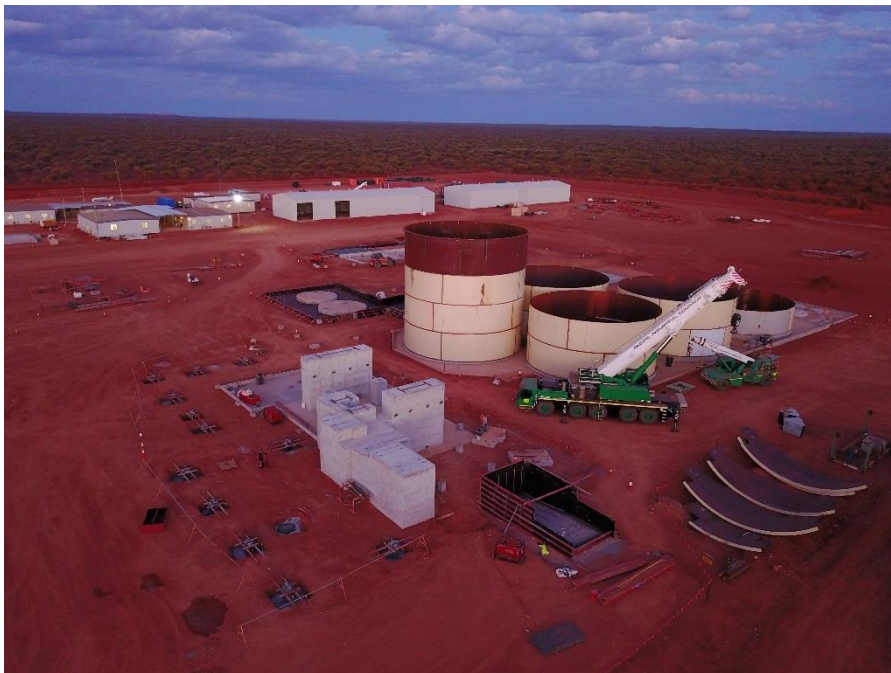
Construction of the Dalgara Gold Project Well Advanced