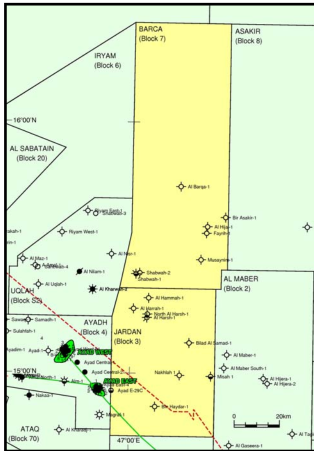
Map 3 Block 74, Yemen