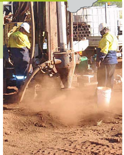
Figure 1 Drill rig during drilling of HWB1, Hamersley Project E47/882, July 2008.