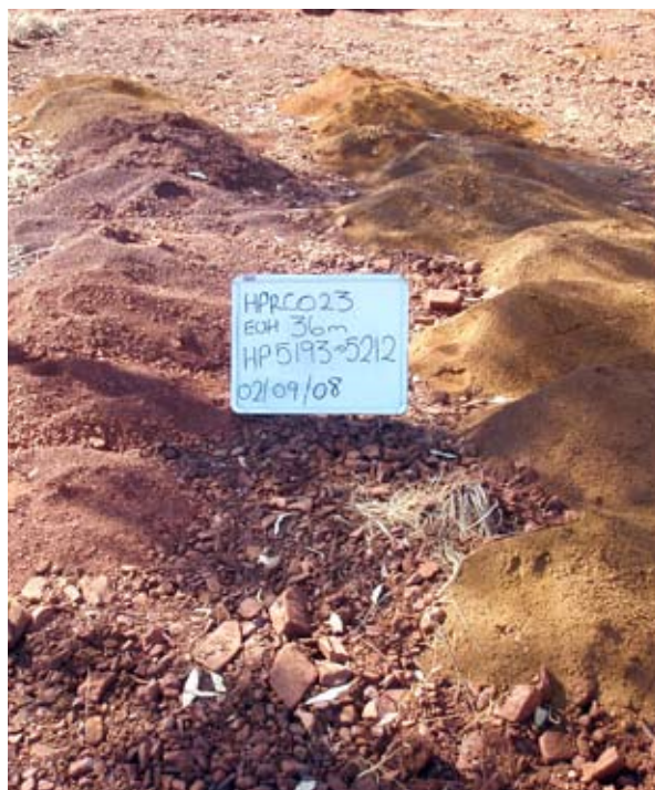
Drill cuttings from HRC23