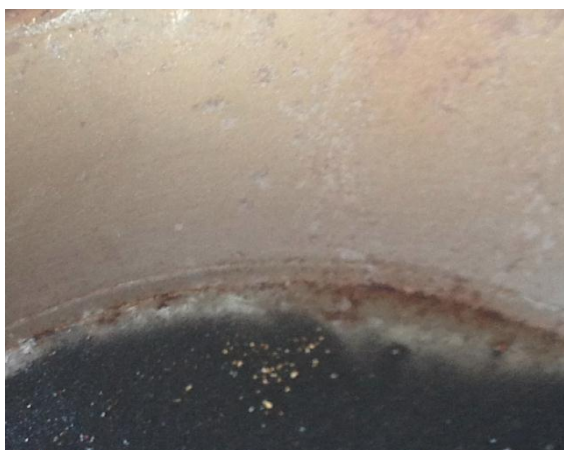
Example of gold in concentrate from previously dredged gravel profile

Testing on EL1616 has progressed well, with zones of both coarse and fine gold identified in panning checks of concentrate produced by the test plant. Testing is being undertaken in the previously un-mined areas of the Bulolo valley as well as over the previously dredged areas. The initial physical part of the sampling program will be progressed to completion in the coming weeks, after which time concentrate samples from the program will be dispatched to ALS for assay and testing.