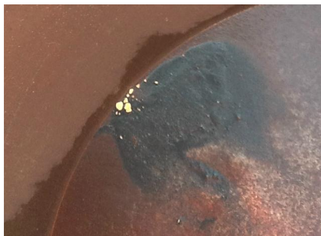
Example of gold in concentrate from virgin areas in the south of the Bulolo Farm area