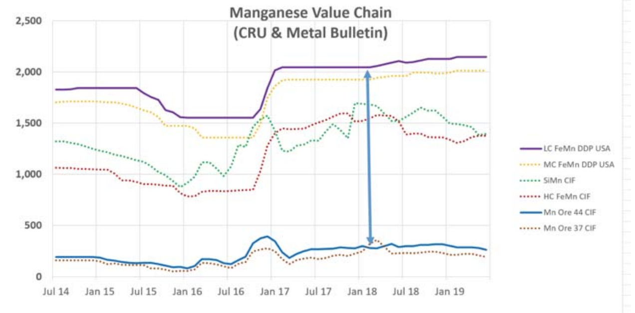
Figure 3: Low Carbon FeMn Project Value Proposition

The below graph shows the value proposition of the project and value differential between selling manganese ore and the refined alloys of low carbon and medium carbon ferromanganese alloys.