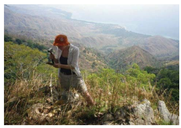
Field Work in Timor-Leste