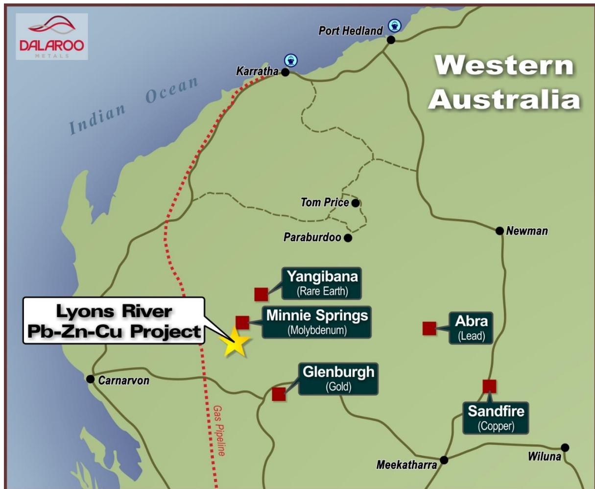
Figure 3: Lyons River Project location diagram

Lyons River is located approximately 1,100km north of Perth and approximately 220 km to the north-east of the coastal town of Carnarvon, Western Australia. The Lyons River Project lies within the Mutherbukin Zone of the Gascoyne Province, which is the deformed and high-grade metamorphic core zone of the early Proterozoic Capricorn Orogen (Figure 3).