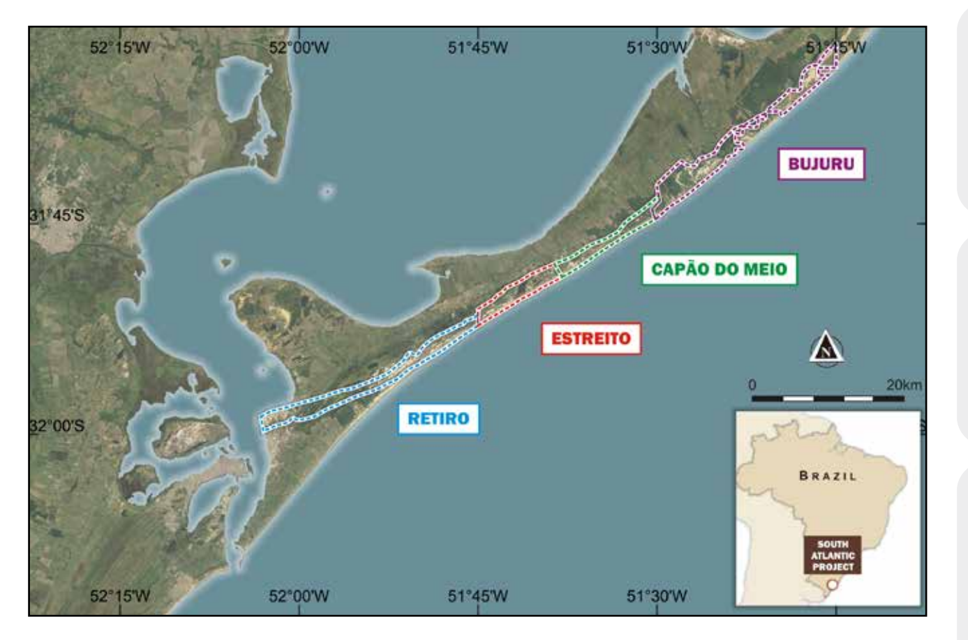
Figure 5: South Atlantic Project - prospects, including Retiro and Bujuru Exploration Targets

Four main deposits have been identified within the project area: Retiro, Estreito, Capao do Meio and Bujuru with Exploration Targets developed for the Retiro and Bujuru deposits. RGM intends to commence a drilling program of up to 10,000m in late 2023.