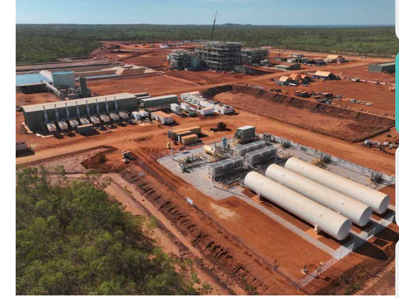
Figure 4: Thunderbird mine site overview

Waste mining contractor, Carey Mining, mobilised excavation and trucking fleet to site, commencing clearing and grubbing activities, with commenced waste mining to enable mining contractor Piacentini & Son to access the starter pit location in the September 2023 quarter.