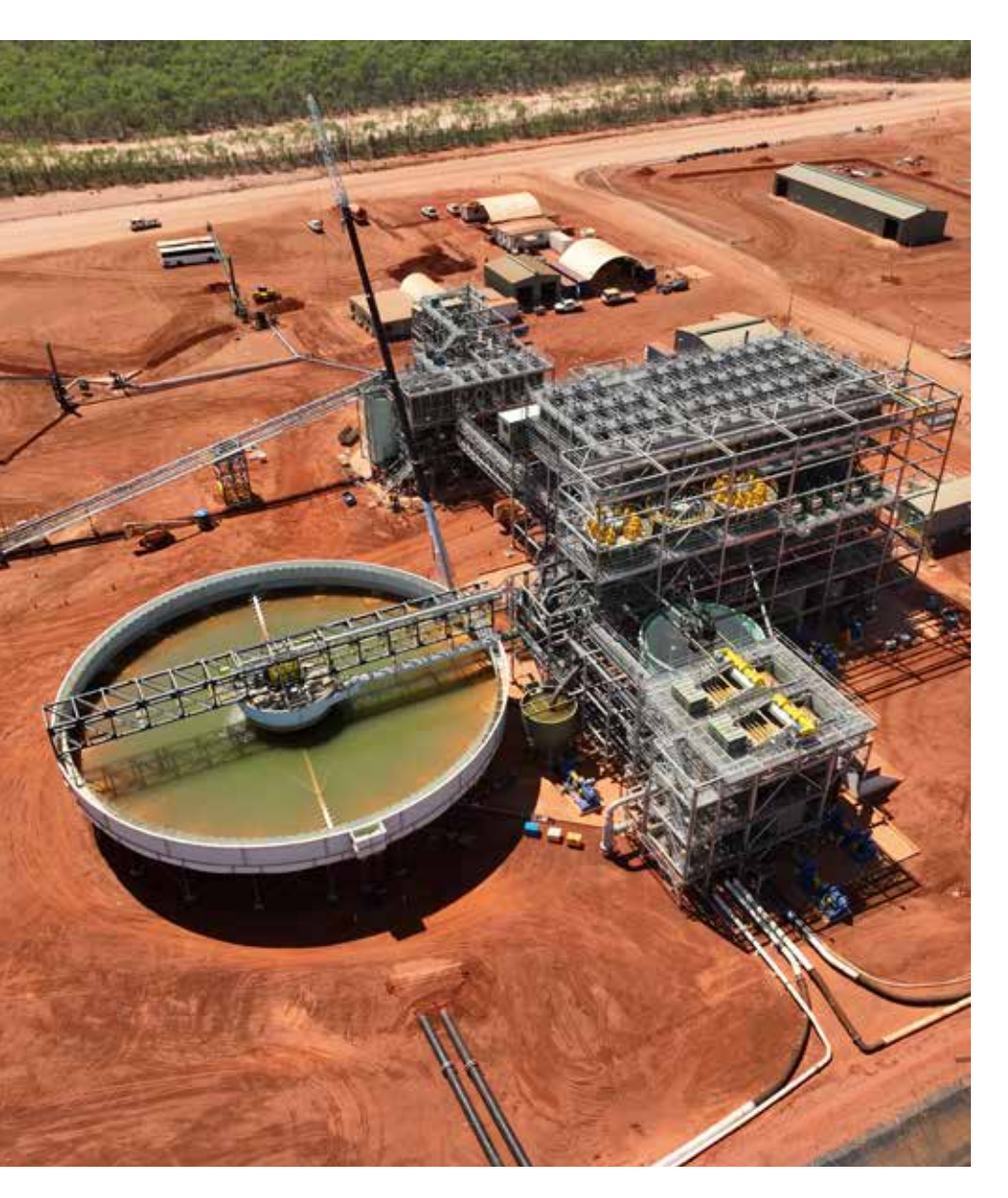
Figure 1: Construction in progress at the Thunderbird Mineral Sands Project