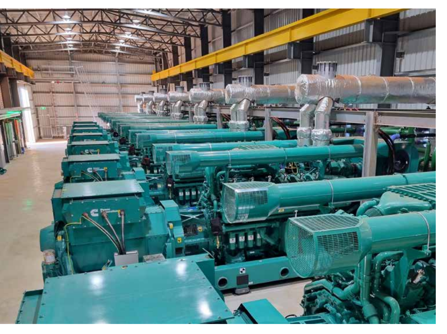
Figure 3: Progressive installation of power generation units