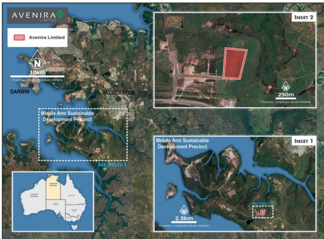
Figure 2: Location of Land in the Middle Arm Sustainable Development Precinct for Avenira's LFP Project

Avenira and Aleees are working closely with the Northern Territory Government via a tripartite MOU to collaboratively work on advancing the LFP battery cathode manufacturing plant in Darwin, Australia. In support of this plan, the Northern Territory Land Development Council has issued a 'do-not-deal' commitment for an allocation of land within the Middle Arm Sustainable Development Precinct. The site is preferentially located to meet the requirements for the manufacturing facility and underscores the Northern Territory Government's commitment to facilitating the LFP Project.