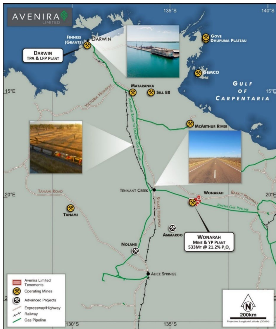
Figure 1: Location map of Wonarah