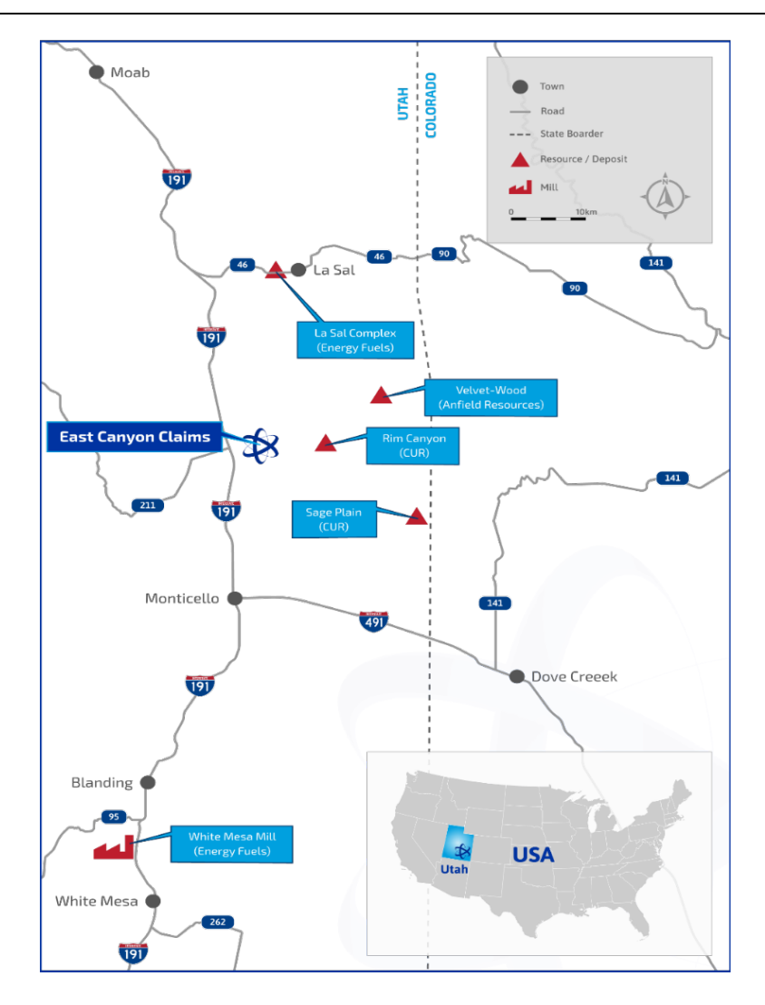
Map 1 - East Canyon Project – Location & Access