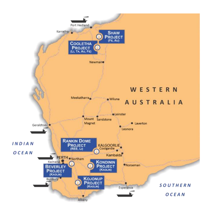
Figure 1 – ACM Portfolio of Western Australian projects