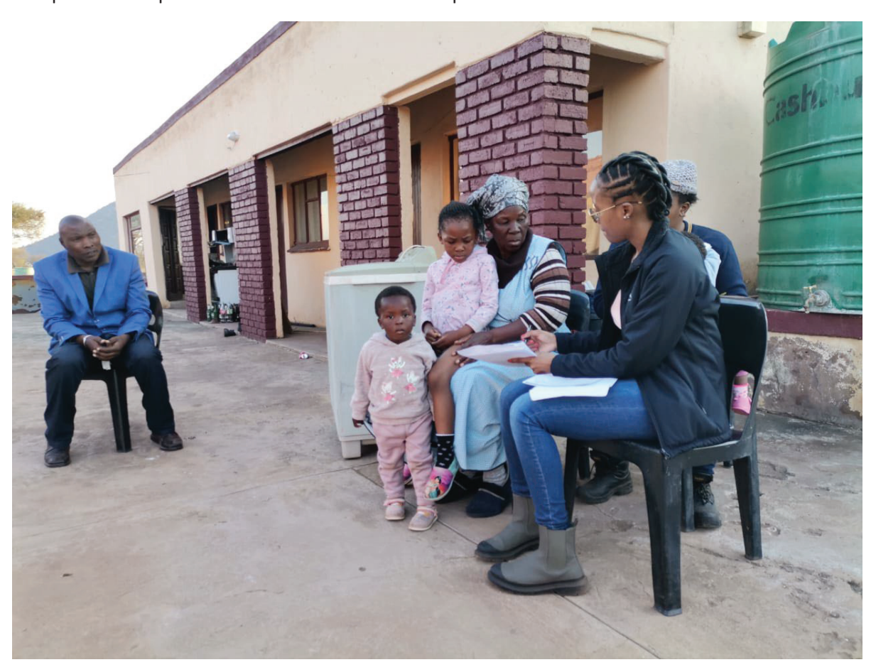
One-on-one consultations are held with land occupants affected by drilling operations.

One-on-one consultations are held with land occupants affected by drilling operations prior to the movement of a drill rig into an identified area. Through structured Surface Rights Usage and Access Agreements, impacted persons may be liable for monetary compensation by the Company. Compensation is paid once a drillhole has been completed.