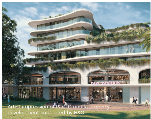
Artist impression of Parc Cronulla property development supported by H&G