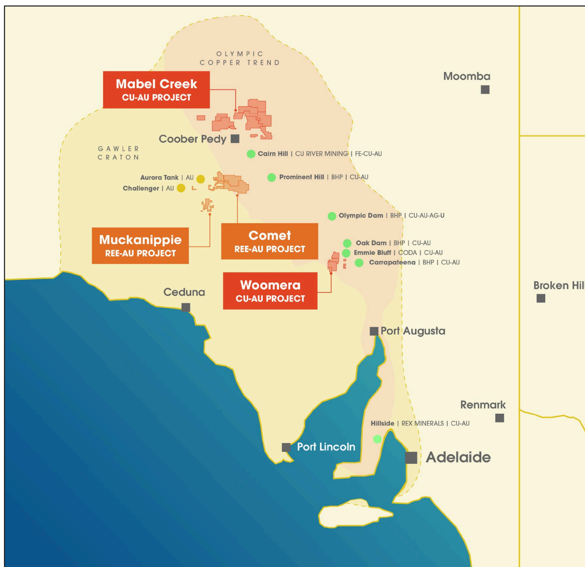
PTR's Project Locations in South Australia

PTR has several exciting copper-gold targets at its Mabel Creek and Woomera Projects located within the Olympic Copper-Gold Trend. Targeting work has defined several compelling Tier 1 Copper-Gold targets which are near drill ready.