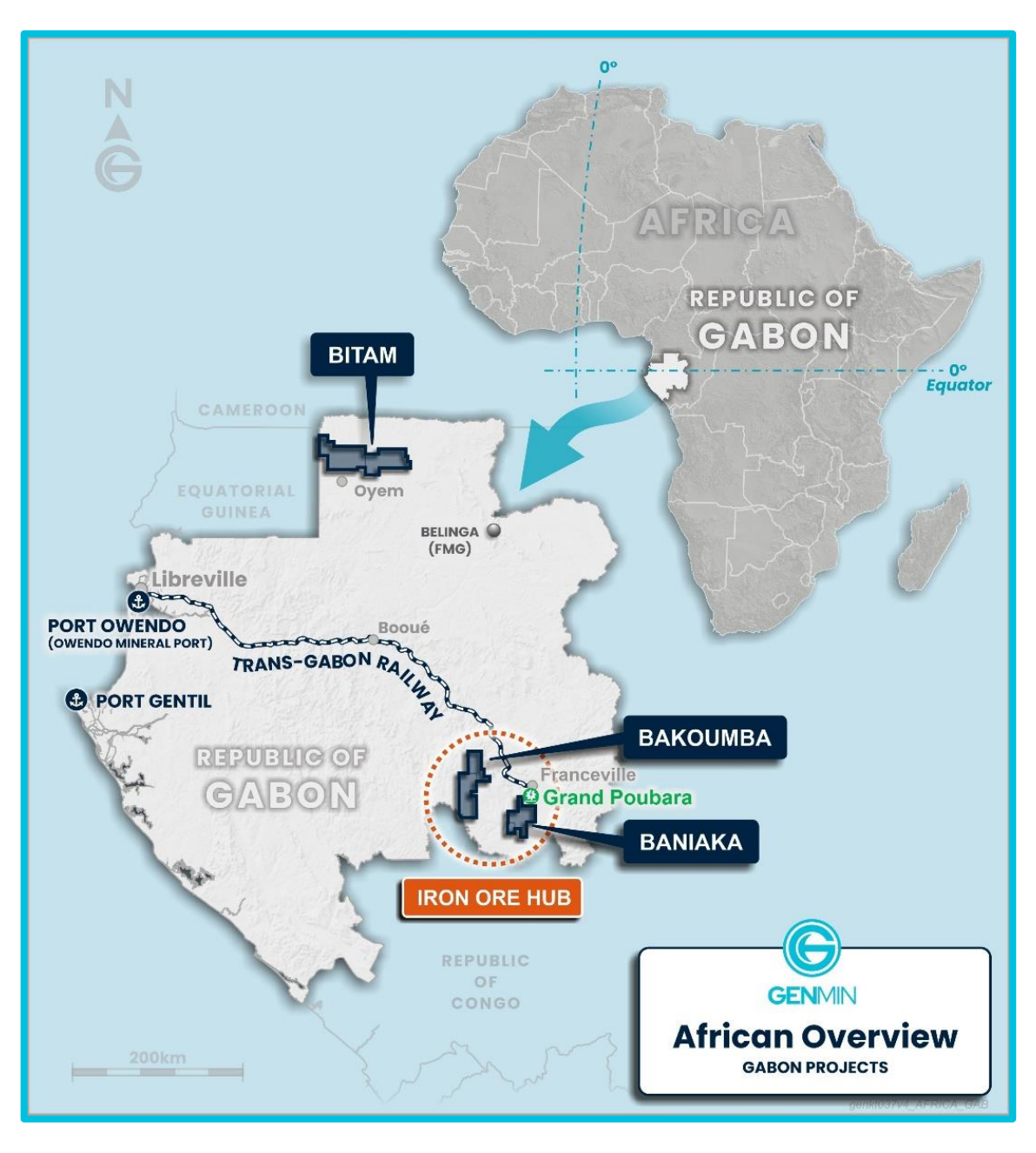
Figure 1: Location map of Genmin's projects in Gabon

Following the completion of the PFS and given that Baniaka was supported by commercial offerings to supply renewable energy and for the provision of a mine to port transport and ship-loading solution, and is a simple, shallow, low strip open pit mining operation using a traditional wet iron ore processing flowsheet, the Board made the decision to immediately progress pre-development activities including the procurement of critical approvals and permits. Consequently, the focus throughout 2023 was to achieve the key milestones of environmental approval and procuring a large-scale, twenty-year mining permit, together providing regulatory approval to build and operate Baniaka.