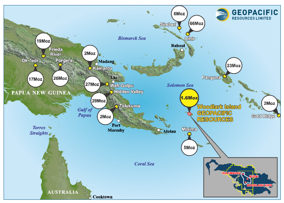
Woodlark's regional setting - the "Pacific Ring of Fire"

Key Project permits are in place and Geopacific Resources Limited ( Geopacific or the Company ) is positioned to leverage off extensive previous investment in drilling, development studies, assets and infrastructure.