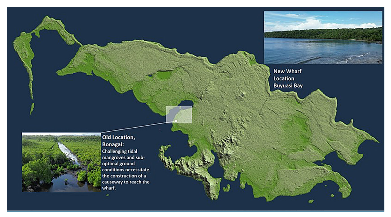
Old and proposed new wharf locations

The revised wharf location reduces the challenges associated with construction through the Bonagai mangroves and eliminates the requirement for a dedicated road out to the marine facility. Preliminary assessments of wave and bathymetry data support suitability of the wharf at Buyuasi Bay.