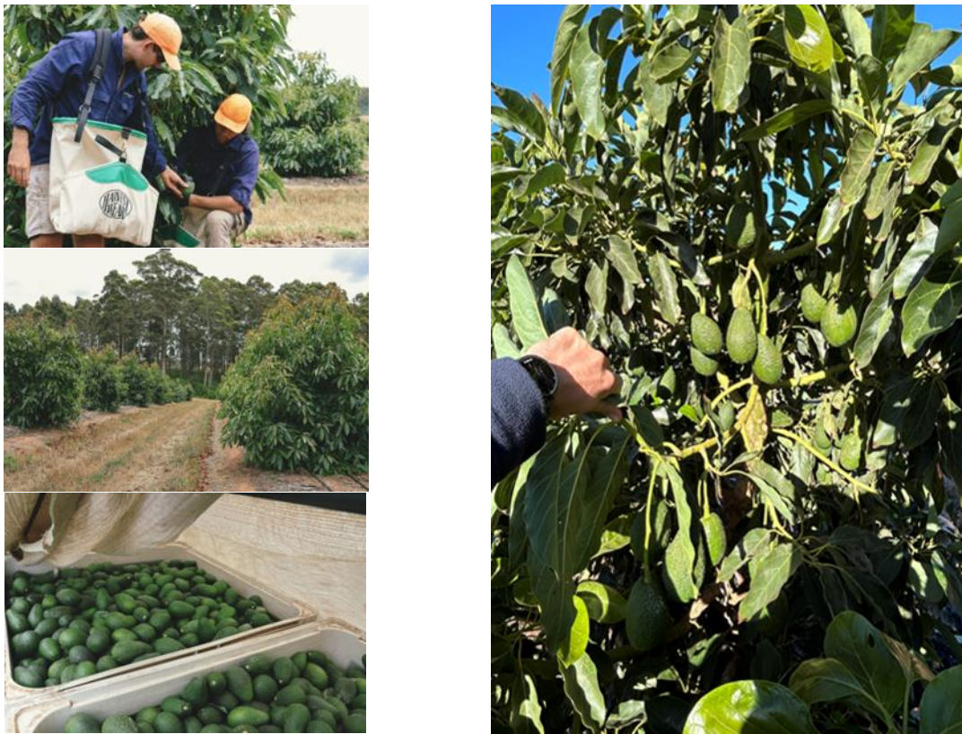
Figure 1: First Harvest and fruit set

Preparation for a Stage 4 development is continuing with clearance of the proposed planting area well advanced. Due to commercial considerations the company will not proceed with planting in 2024 however an investment decision on the final scale and timing of Stage 4 will be made for the following year closer to the time and subject to routine commercial considerations.