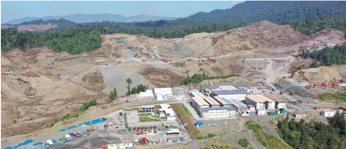
Earthworks and footings at ENC largely complete in readiness of concrete pouring and plant erection