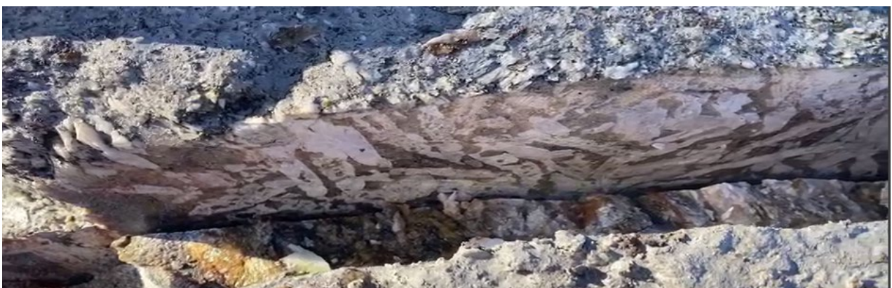
Photo of channel sample F0373658 and spodumene crystals at the Benham property (ref announcement 18/01/24)