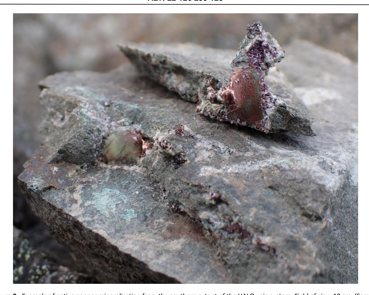
Figure 9 - Example of native copper mineralisation from the southern extent of the HALO vein system. Field of view 10 cm. (Sample F005999).