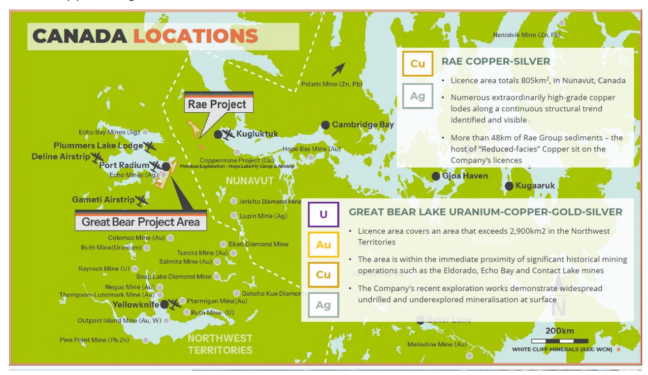
Figure 1: Location of the Great Bear and Rae Projects in Canada

During the reporting period, the Company acquired the Great Bear Lake U-Cu-Au-Ag Project and the Rae Project in Canada, pivoting its exploration focus to potentially large scale and high grade Cu-Au-Ag in historically producing areas.