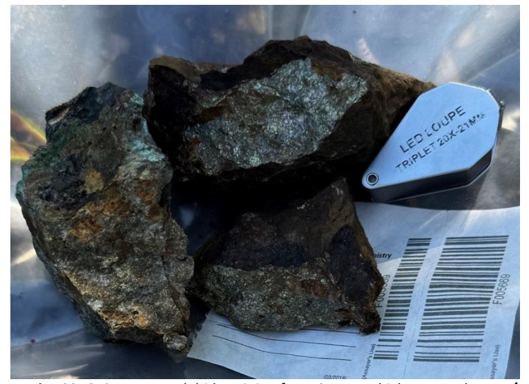
Figure 3 - Photograph of sample F005673, quartz-sulphide veining from Coyote which returned 17.4g/t Au, 1.47% Cu, 29.6g/t Ag.

At Payback, 13km south of Phoenix, assays from four massive sulphide rock chip samples returned: