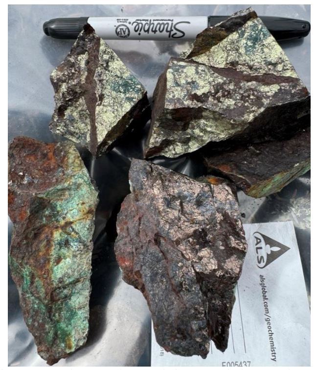
Figure 2 – Photograph of sample F005437 with massive bornite-chalcopyrite which returned 42.60% Cu, 2.28g/t Au, 159g/t Ag, 0.364% Co from the Glacier IOCG trend.