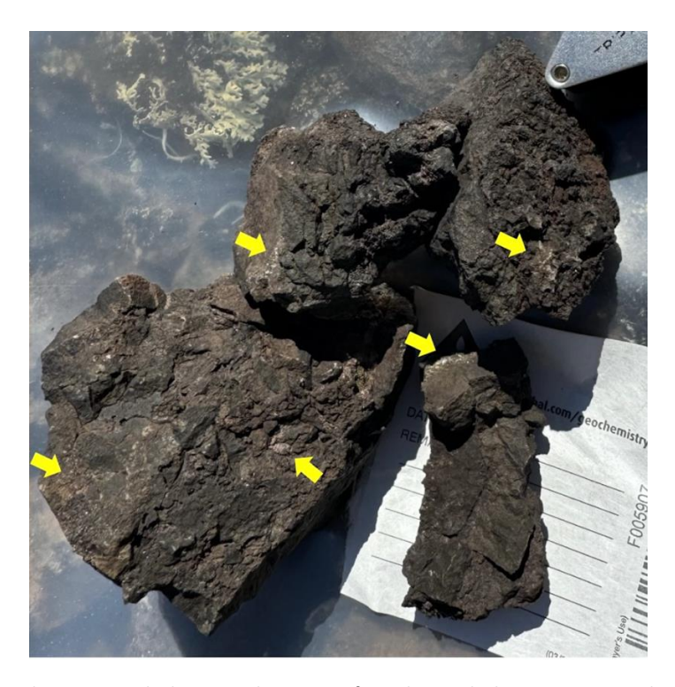
Figure 5 – Photograph of sample F005907 which returned 7.54% Ag from the Spud Silver occurrence. Silver present within the chlorite altered host rock and within the breccia cement phase alongside calcite. Yellow arrows point to visible native silver.

Charlie, a skarn horizon covering a strike of approximately 900m, previously identified by state geologists has returned consistently high-grade polymetallic results adding further depth to the metal basket at Great Bear: