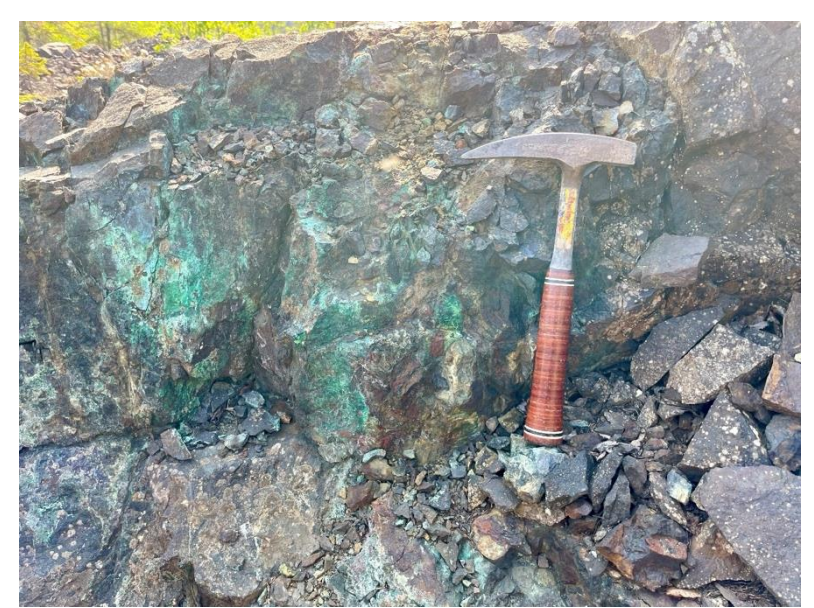
Figure 4 – Photograph of mineralised outcrop for sample F005604 which returned 716g/t Ag and 42.2% Cu at Payback.