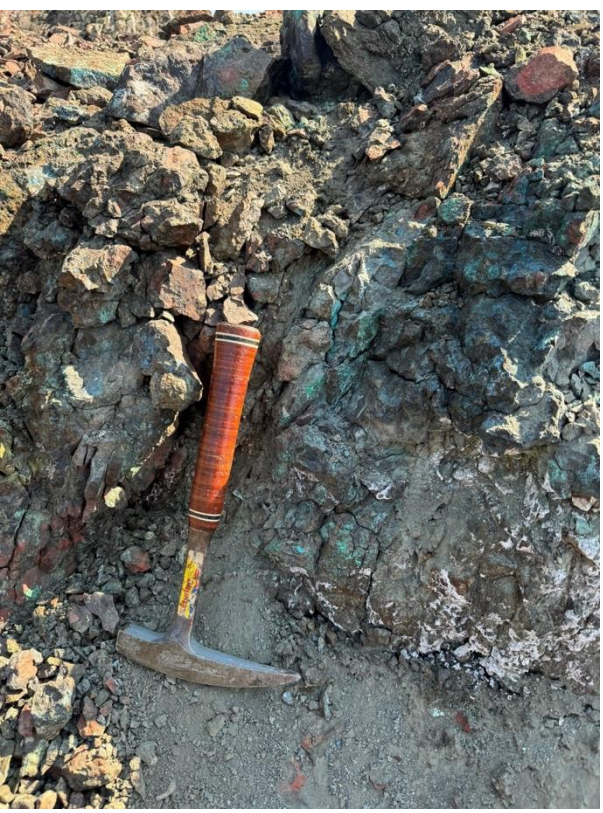
Figure 6 – Outcrop photograph for sample F005408 illustrating a brick red K-feldspar-skarn breccia with abundant copper secondary minerals after chalcopyrite-bornite-chalcocite sulphides. Sample returned 233g/t Ag, 9.82% Cu, 1.67% Pb. 2.35% Zn .