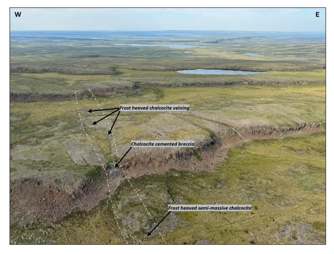
Figure 10 - Aerial photograph of the northern extents of the 440 m HALO vein system. The mineralisation cuts through the northerly dipping basalt flows and is easily traceable along strike following topographic depressions and trails of copper sulphides and <u>secondary minerals brought to surface through the thin cover by frost heave action.</u>