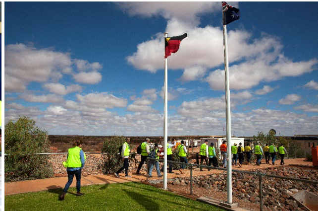
Kurrbili Village Tour (Yangibana)