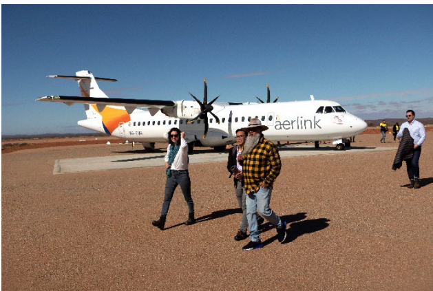
Attendees arrive at Yangibana Airport

During July 2024, Hastings hosted a large group of investors, media, banks, research analysts, government and key stakeholders for a site visit, showcasing the infrastructure and progress at Yangibana. The positive feedback received has reinforced Hastings's commitment to deliver the Yangibana Rare Earths & Niobium Project.