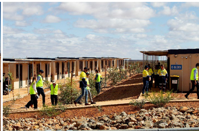
Kurrbili Village (Yangibana)