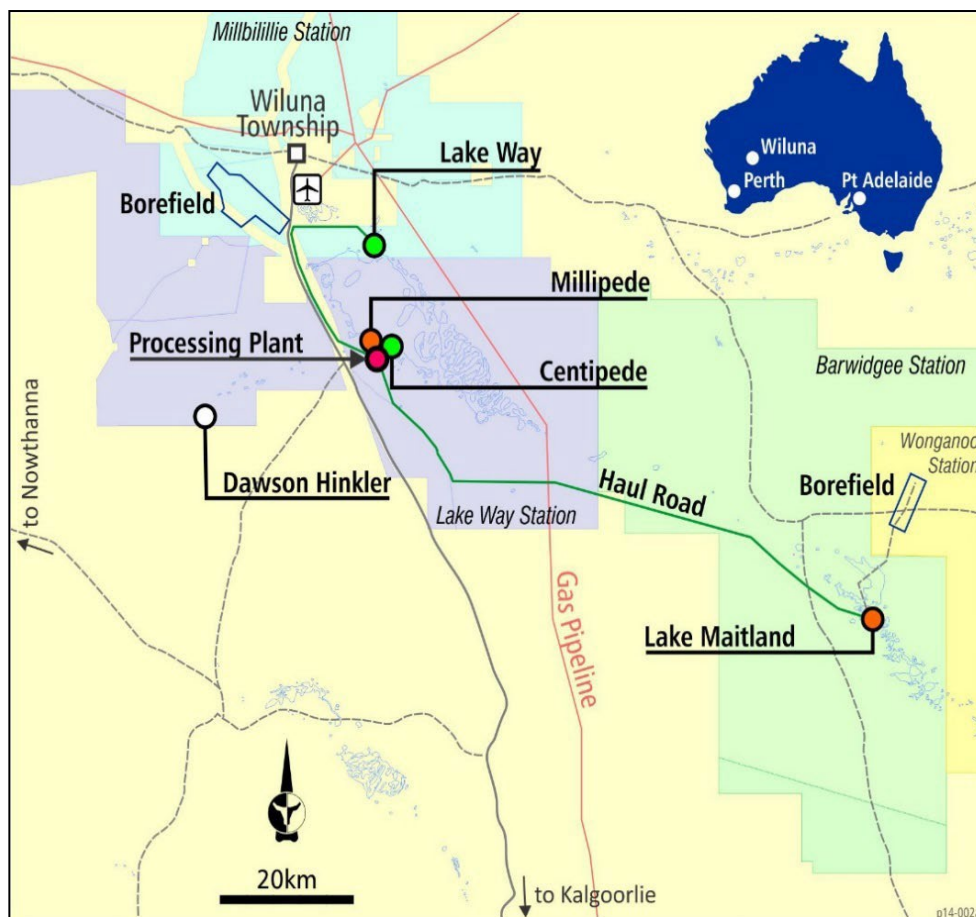
Figure 1: Location of the Wiluna Uranium Project

This is in addition to the vanadium resource of 141.8Mt grading 286ppm V_2O_5 for 89.3Mlbs of contained V_2O_5 at a 100ppm V_2O_5 cut-off (inside the U_3O_8 resource envelope) as referred to above (JORC2012 – Inferred – refer to the Company's ASX announcement of 21 October 2019).