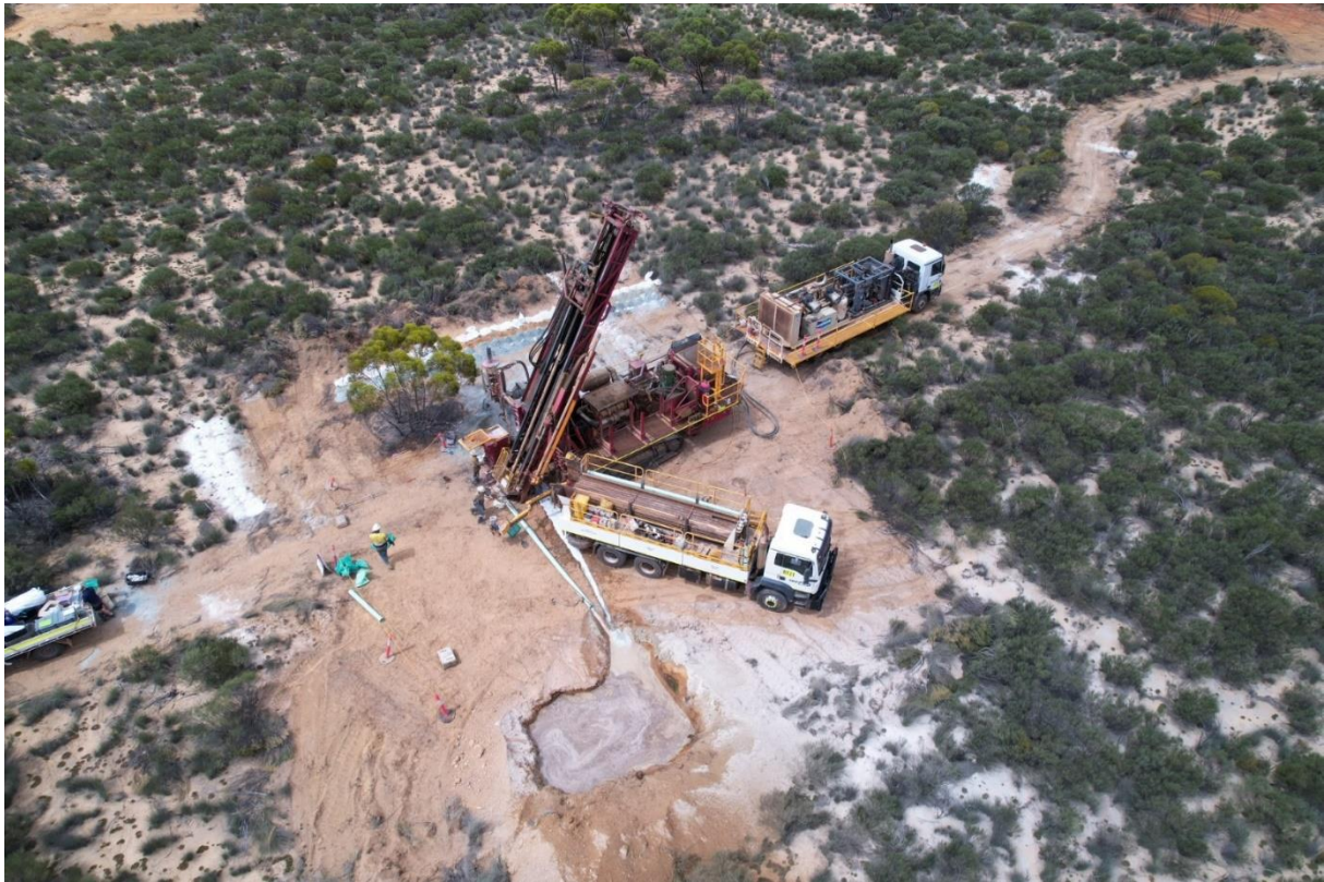
Phase 3 RC drilling at the Louie Prospect

The samples collected during the campaign have been submitted for assay in Perth, with results expected early next year. The Company remains on track to commence aircore drilling in January/February 2025, a program designed to test ~8km of highly prospective, untested strike.