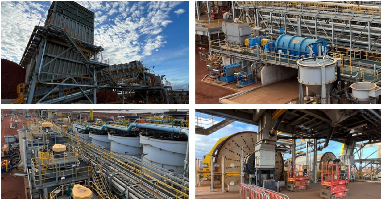
Stage 2 Circuits: Crusher, Regrind Mil, Flotation, SAG & Ball Mills

Construction of the Hybrid Power Station is progressing as planned. Gas bullets have been placed on site and the gas generators have been installed. Operation of the gas power generation assets is planned from March. Earthworks for the solar farm commenced and the solar panels are planned to be delivered to site this quarter.